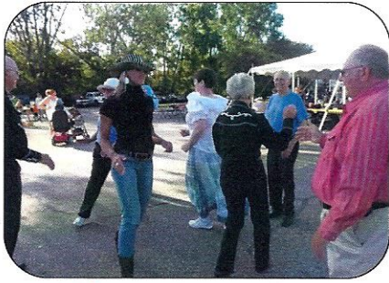
Demos at care centers