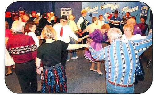
Friendship Set to Music