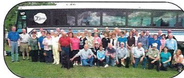
Mystery bus trips