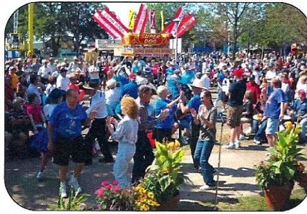
Square dancing @ Minnesota State Fair